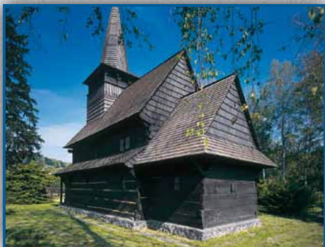
The wooden church in Dobříkov

The distinct dominant of the city is the wooden folk building with the tower covered by a shingled roof. The church was originally built in 1679 in Velká Kopaň in Carpathian Ruthenia and it was carried to Dobříkov in 1930 owing to the senator Václav Klofáč. The church was damaged then and the tower was not completed. After the reconstruction it was donated to the Czechoslovakian Hussite Church. The church is made from the oaken planks in the byzantine-gothic style.