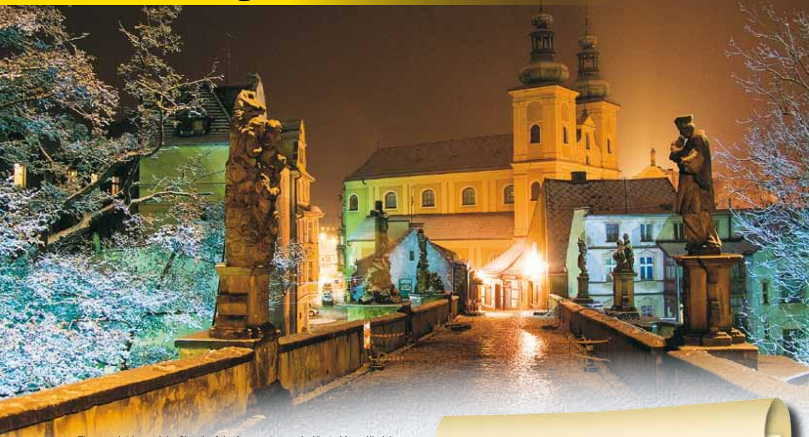
The stone bridge and the Church of the Assumption on the Virgin Mary, Kłodzko