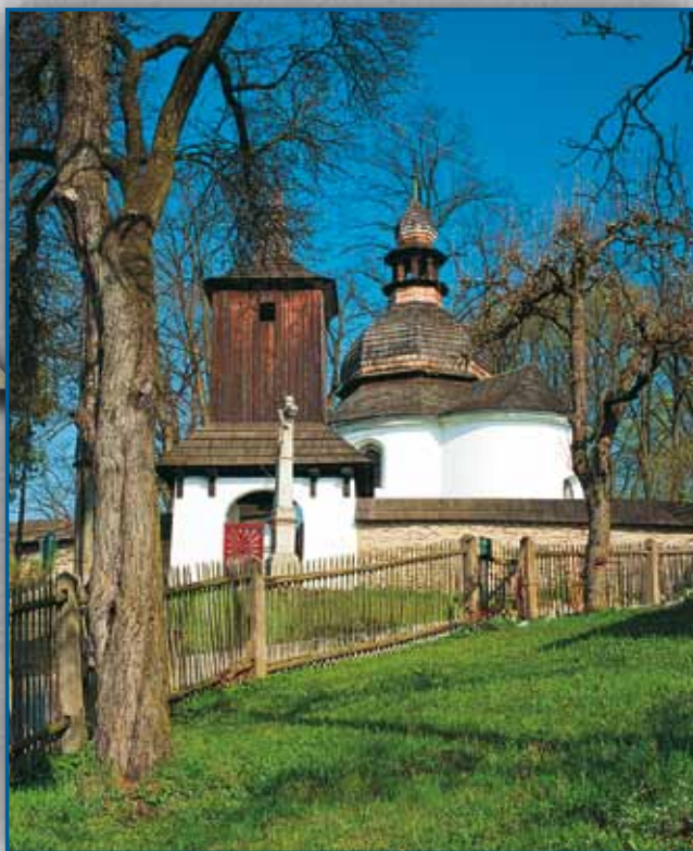
The Romanesque rotunda in Česká Třebová

The only Romanesque style rotunda in the Eastern Bohemia region is located in Česká Třebová. It is a part of the St. Catherine's Chapel and we can find it in the middle of the cemetery on the right riverbank of the river Třebovka.