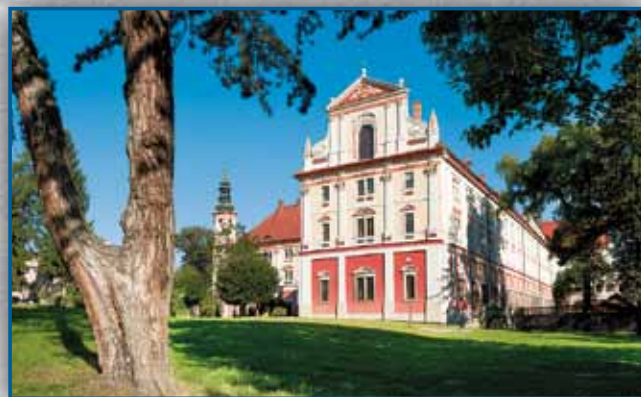
Henryków, the Cistercian abbey

Kamieniec Ząbkowicki is our first Polish destination. The already mentioned Princess Marianna of Orange built there a neo-gothic castle in the 19 th century. It is surrounded by a park that includes precious woods. The castle has some of the Mauritanian elements thanks to the designer K. Schinkel. Nowadays only a part of the castle is open to the public.