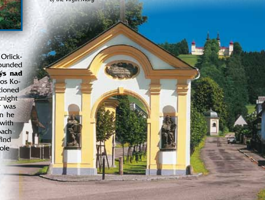
The entrance gate at the Stations of the Cross to the Church of the Assumption of the Virgin Mary