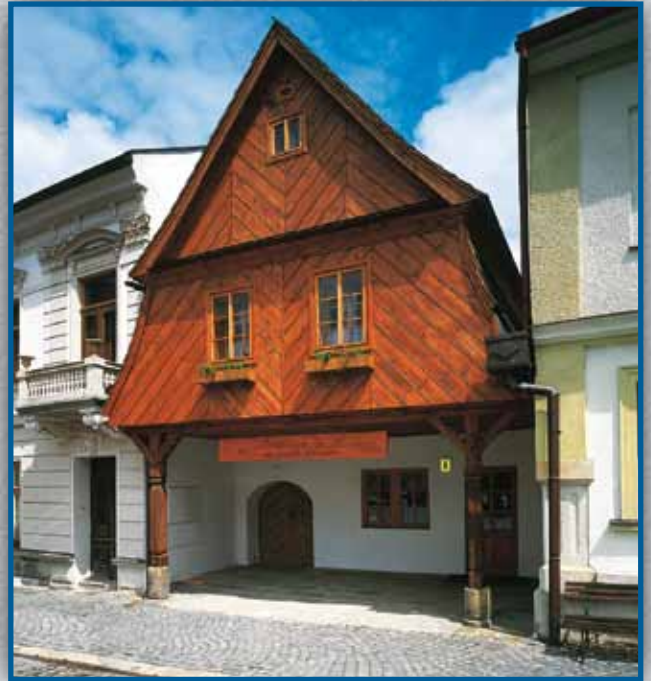
One of the timbered houses in Jablonné nad Orlicí