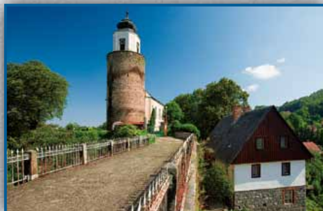
St. Joseph's Church in Žulová

The rarity of the village is the classicist St. Joseph's Church which replaced a former castle. The castle was probably built illegally at the end of the 13 th century on the land of the Vratislav bishopric by already mentioned Jan Wustenhube. In the last third of the 16 th century the castle was rebuilt in the renaissance style. Afterwards it was conquered and sacked by the Swedish army in 1639. The castle gradually became a ruin but in 1703 it was built again and converted into a brewery. In the next century the whole complex was donated to the city by the bishop Hohenlohe to establish a church there. Only the cylindrical tower in the fore-part of the castle was saved. Its walls are 4m wide. Instead of the tower, which is called the bergfried, only a piece of the wall on the northern side survived. The wall was broken through on the ground floor