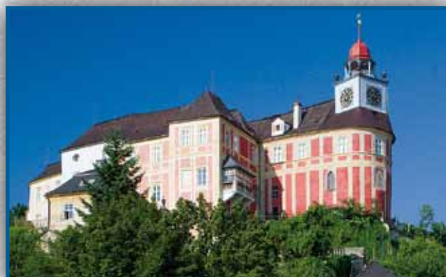
The castle Janský vrch

We can visit the castle Janský vrch in Javorník in the north of the Jeseníky region. Its current impressive appearance comes from the 16 th century. It replaced the gothic castle which was built there in the 13 th century as a possession of the Dukes of Svidník. They donated the castle to the Vratislav's bishop in 1348. It was damaged during the Hussite wars and repaired as late as the 16 th century, especially owing to the bishop J. Thurzo. The reconstruction ran in the 17 th and 18 th centuries. Since the 17 th century it had been a seat of the Vratislav's bishops. The park was created there in 1800 and it was added to the French gardens from 1776. Indoors you can imagine the owner's way of living thanks to the preserved renaissance style and biedermeier style furniture. Furthermore you can see an extraordinary collection of pipes and smokers' necessities there.