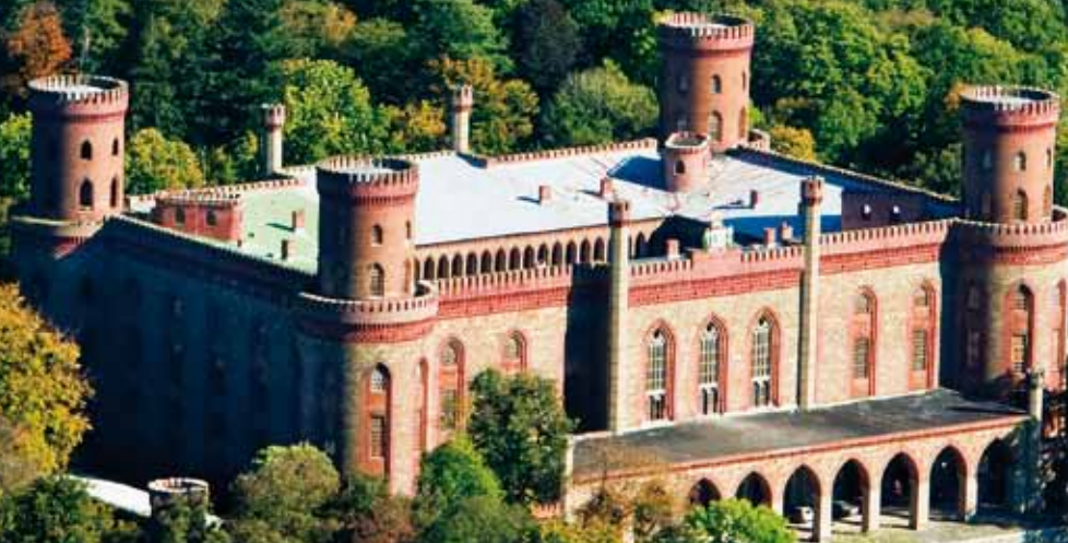
The castle Kamieniec Ząbkowicki