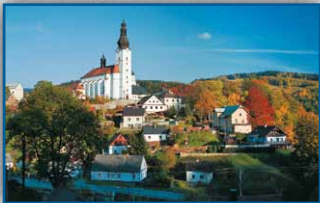
The late renaissance church in Branná

After the excursion we return to the original route and we head for the Branná village (since 1949 it has been called Kolštejn). The ruin of Kolštejn is situated at the rocky promontory above the valley of the Branná River. Its strategic location helped to protect the former road leading from Moravia to Silesia. The castle is shielded by the wide renaissance castle from the north. The first written record of the castle is stated in the document from 3 May, 1325. The inscription confirmed the trade between Jan Wustenhube and the monastery in Kamienec Żąbkowicki. A late renaissance church is also a notable monument of the village.