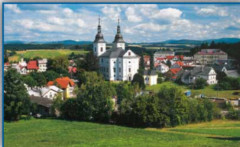
St. Václav's Church in the centre of Žamberk

The town was founded approximately at the end of the 13 th century. The first mention comes from 1341 when the confiscated possession including the Žamberk town was returned to Jan of Potštejn and his under-aged brothers by King Jan Lucemburský. At the end of the 16 th century the domain of Mikuláš of Bubno was moved from the castle Litice to Žamberk, where he built a renaissance castle. The current form of the castle was created in 1810-1815. The massive two-towered St. Václav's Church is regarded the dominant building of the city. The previous wooden church was established in 1369, but afterwards it burnt down and then it was built again in 1729-38 under the management of the architect D. T. Morazzi from Chrudim. The side Communion table was decorated by the painting of St. Antonius made by the Czech baroque genius Petr Brandl.