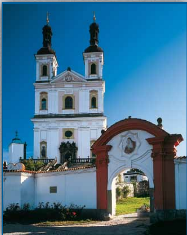
The pilgrim church in Luže