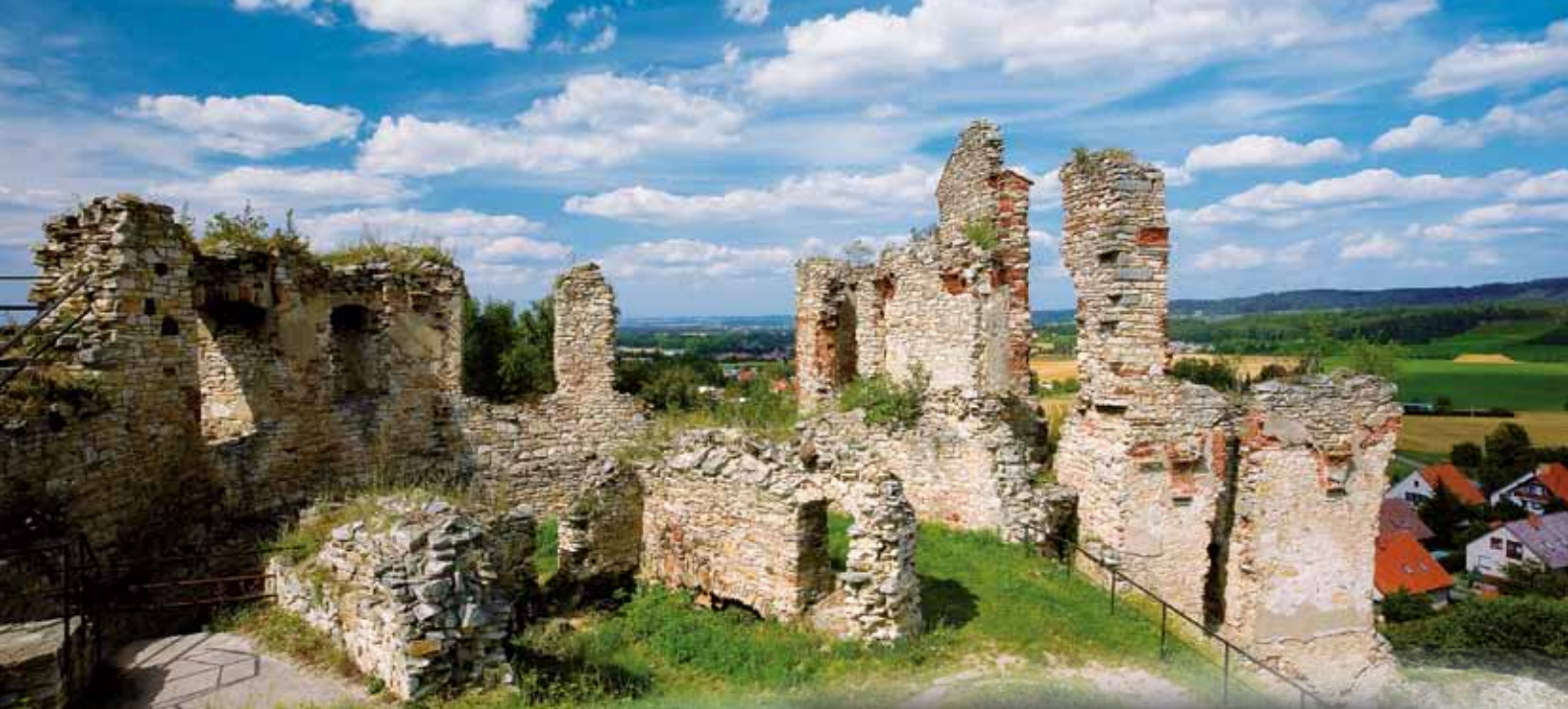
The ruin Košumberk