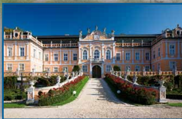
The castle Nové Hradý

If we travel through the Litomyšl region, we should not forget to visit Nové Hradý. The rococo castle Nové Hradý was built by Jan Antonín Harbuval-Chamaré in 1773-83 according to a principle of the strict axial symmetry. The castle has been repaired recently and it is open for the public. Sometimes it is called "The East Bohemian Versailles".