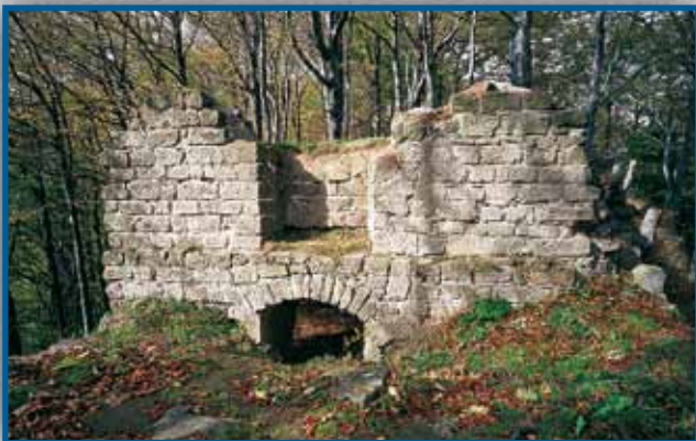
The ruin Žampach

Previous gothic style provost St. Václav's Church is first-ly mentioned in 1350. The gothic cathedral burnt down in 1645, then it was repaired and eight years later the aisle was added. Until the 18 th century there was no tower. The com-