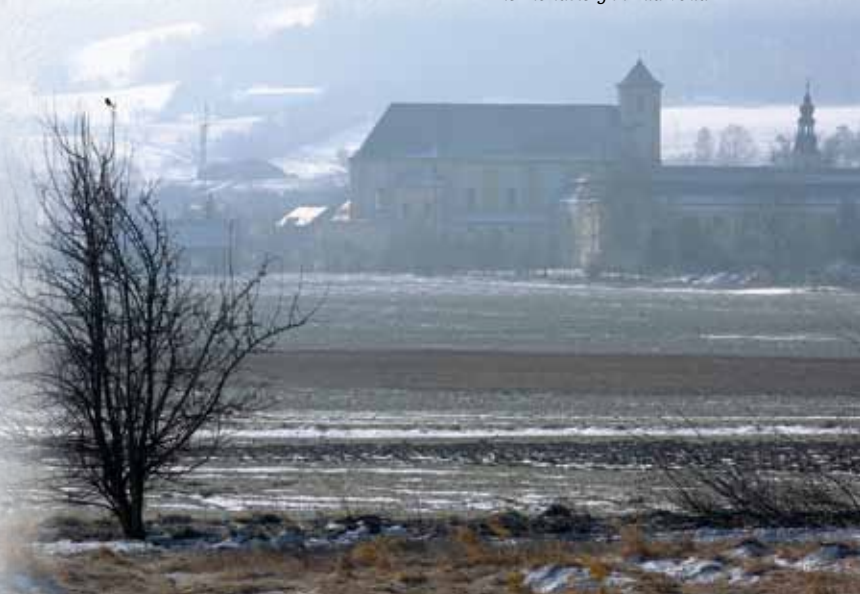
The monastery in Bílá Voda

An interesting fact is the unnatural establishment of the borderline near Bílá Voda. It originated as the result of the deal between Queen Marie Terezie and the Prussian King Fridrich II from 1742. At first it was understood as a provisional measure, but finally it survived to the present.