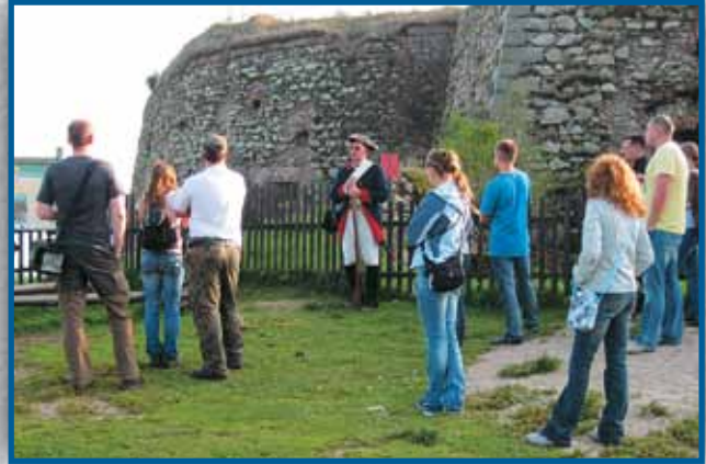
The guides in Srebrna Góra wear period uniforms