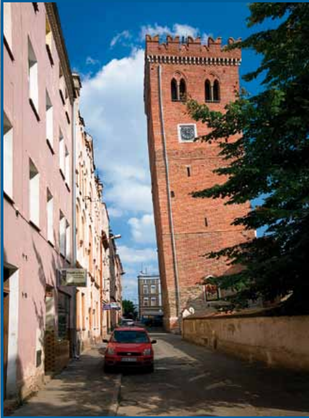
Żabkowice Śląskie, the leaning tower