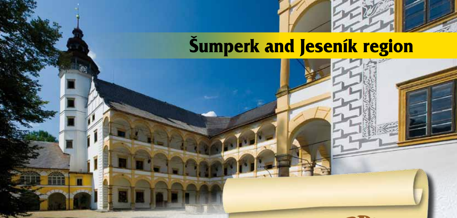
The castle in Velké Losiny

From the Králíky region we pass by the massif of Krállický Sněžník to the Hanušovice village, where we can turn off to the south to Kopřivná and visit the ruins Nový hrad. At one time it was one of the largest castle complexes in the North Moravia. Its proud silhouette of the walls and the tower dominated the local area along the Morava River in the 14 th and 15 th century.