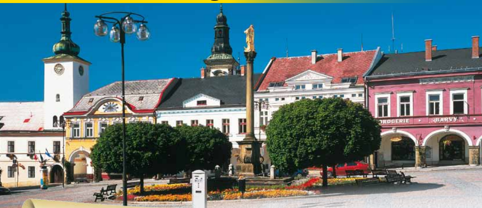
The square in Ústí nad Orlicí