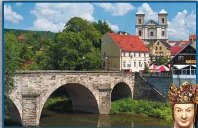
Bardo, The Basilica of the Virgin Mary and the Madonna from its Communion table

Bardo is sometimes called Varta, because it is an original name of the town. We can meet the name Varta even in Božena Němcová's book The Grandmother (see above). Tourists can find there a large number of the ecclesiastical buildings and also a ruin of a knightly castle from the 14 th century, but the most important monument is certainly the Basilica of the Virgin Mary. In the middle of the Communion table there is a Roman Madonna that reminds of the existence of this place of pilgrimage since 13 th century. The local former fortified settlement was established in the 11 th century to defend the Poles against the Czech state. Therefore the original name was Wartha (ger.), which means "the guard".