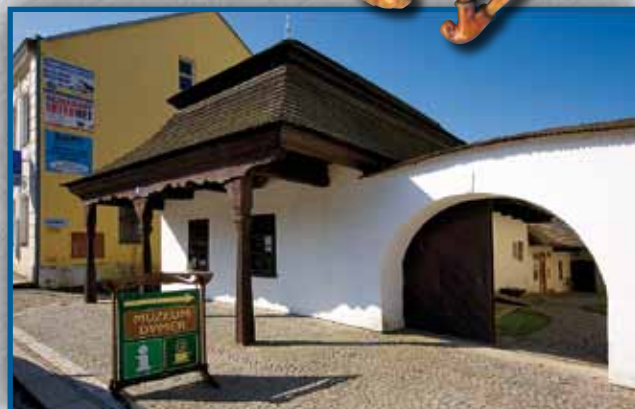
The Pipe Museum in Proseč