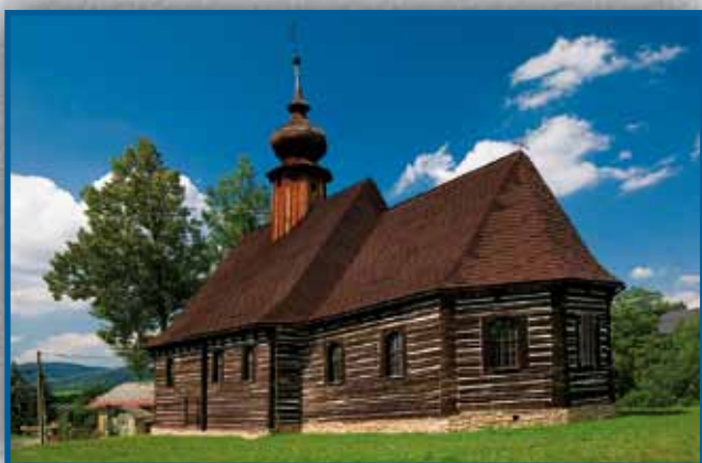
The wooden church in Maršíkov

Šumperk was founded in the 13 th century as an administrative centre of the region of the precious metal mining. However the textile production gradually prevailed. The town was