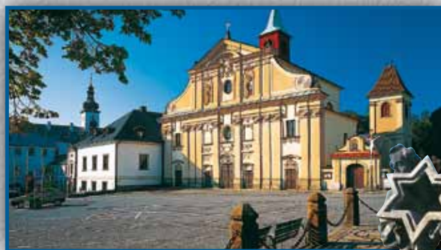
St. Václav's Church in Letohrad and the detail of the sculptural decoration of the plague column in the square